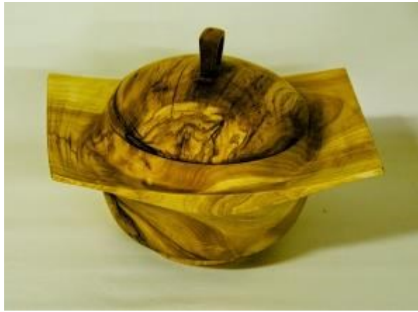
Avi Ben-Ora-Winged Candy Dish with Lid