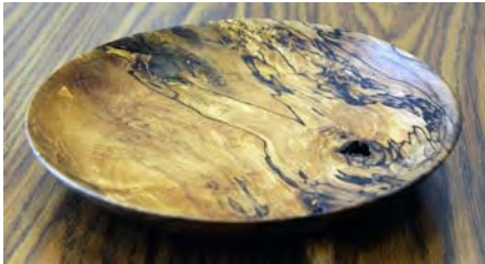
Jim Newport made this beautiful splatted shallow bowl