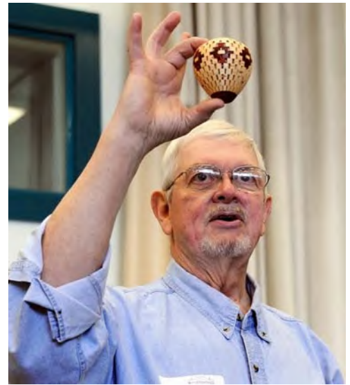
Jim Rodger's small open segment vessel in the miniature style of Harvey Klein—Harvey says make it much smaller.