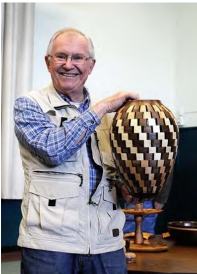
Ron Tinay's first open segment vessel and it's a beauty.