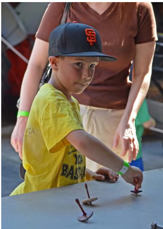
Tops are tops!