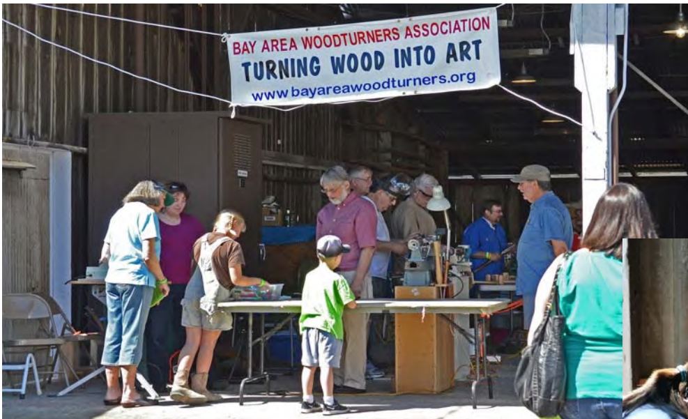
They came, They saw, They took home a top