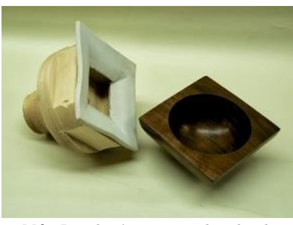
Mike Lanahan's square walnut bowl and square vacuum chuck