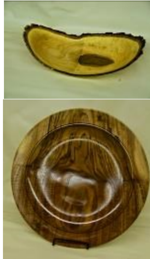
Bob Nolan-Walnut Platter & Natural Edged Bowl