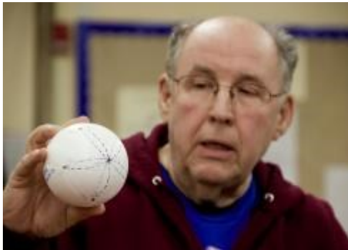
Corwin Jones-Sphere and Pigtail Hook Tool