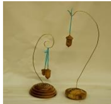
Gary Bingham—Ornament Holders with Acorn Bird- houses