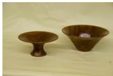
Bill Walzer-Two Walnut Bowls