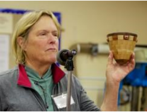
Roz Harper— Segmented Bowl with Fused Glass