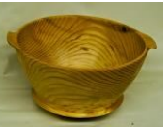
Avi Ben-Ora—Handled Bowls