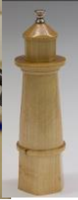
Bob Bean- Lighthouse Pepper Mill