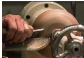
More Shear Scrap- ing of Bottom