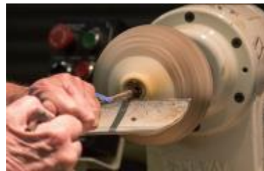
Drilling Depth Hole