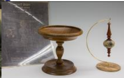
Harvey Klein- Walnut Candy Dish & Buckeye Ornament