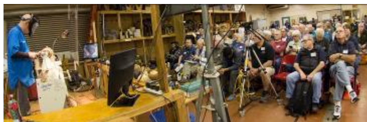
BAWA Members are Spellbound