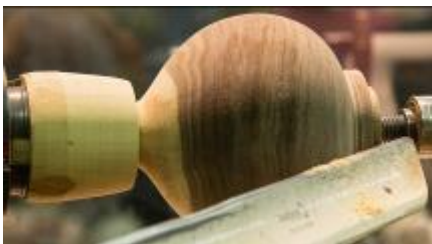
Hollow Form Securely