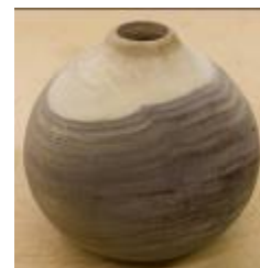
Hollow Form Demo