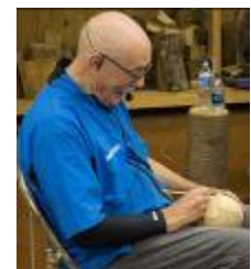
Draws Layout Lines