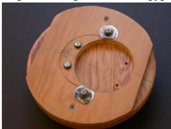
Figure 2b Gene's built jig set for turning the three sets of rings on the bottom of the coaster.

turning the rings on the bottom. Gene uses T_Bolts rather than wood screws to hold the spacer in place. Once the jig is built, you are ready to turn the rings. A ruler, or better yet a marking stick with a notch every 1/4 inch is used to draw concentric rings on the laminate disk, and mark out which rings are to be removed. Figure 3 shows Gene marking out the rings.