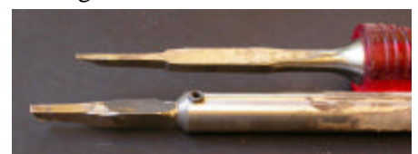
Figure 4 Gene's Turning tools made from an old chisel and bar stock.